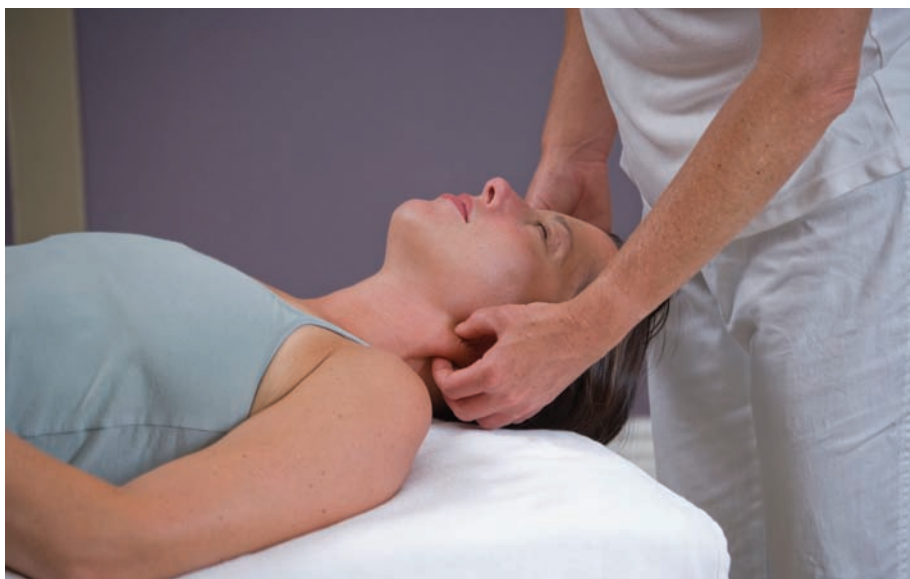
The upper respiratory procedure can help with lymphatic drainage, sinusitis, and hay fever.

The Bowenwork “move” can be described in four distinct stages: contacting the skin, taking the slack, applying the challenge, and rolling over the tissues. ”