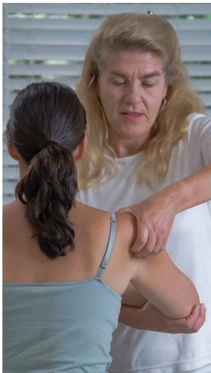
Bowenwork may be done with the client seated, as seen with the shoulder procedure.

Many of my clients find Bowenwork helpful for transitioning major life changes, emotional distress, hormonal changes, recurrent stress, headaches, and physical injuries. Bowenwork “resets” their muscles and nervous